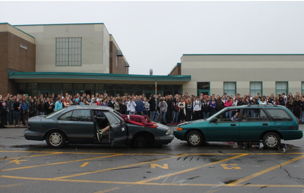
Last year’s TRHS fatal reality demonstration to remind students about the dangers of drinking and driving.

Fatal reality is a tradition that we have had at Timberlane for a few years. The purpose of it is to warn students about the dangers of driving under the influence prior to prom night. The school leaders are always afraid of what might happen after the festivities of the dance, so they do what they can to prevent it. Many students are greatly impacted by the scene. Seeing fellow classmates in a situation like this one helps to show them what could potentially happen if they choose to drink and drive.