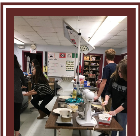
Entrepreneurship students preparing products