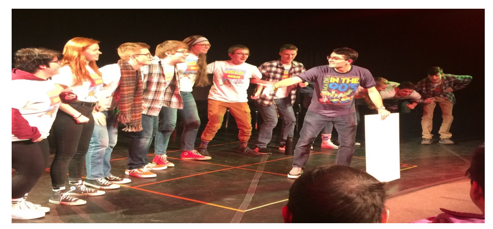
The Milkmen Improv Team reveal their mockumentary film, "Power Struggle," airing in May 2019!

Unlike most sports or clubs that come and go with the season, The Milkmen Improv Team is a year long endeavor. Twelve super talented students ranging from seniors to sophomores perform an unscripted show for ninety minutes with games dabbling in word play, physical comedy, and audience participation. Additionally, all of the Milkmen proceeds go to various organizations; this year, our generous audiences have helped us raise $6,500. If you have yet to see a show this year, be sure to join us on Friday, February 15th at 7:00PM in the Performing Arts Center Recital Hall as we team up with Project Hope to raise money to fight cancer!