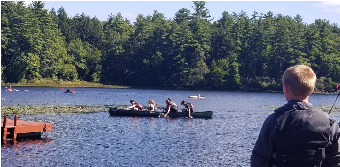
Students paddle a canoe barehanded as others look on.