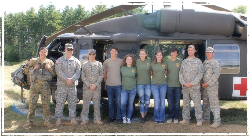
Pictured left: Timberlane Troops students with the Air National Guard Flight Crew during the Black Hawk landing.