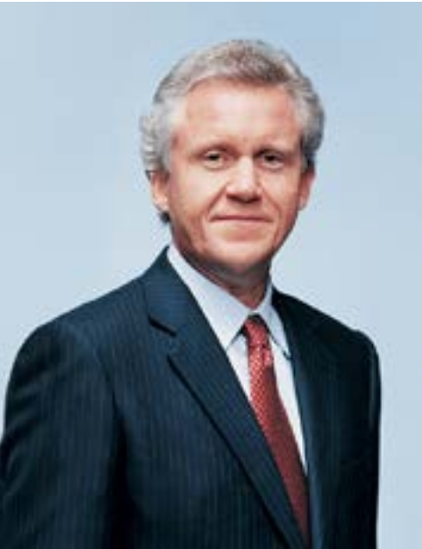
General Electric CEO, Jeffrey Immelt

The company has promised to bring 800 jobs to Boston along with a tremendous amount of tax revenue to the city.