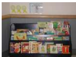
Sandown North Book Exchange Program