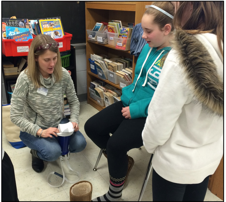
Atkinson Academy students learn about physical therapy at this year's Enrichment Day

Other students had a chance to listen to professionals who work in sales and electronics, information technology, and marketing and technology. Additionally, all students attended an assembly presented by The Children's Museum of New Hampshire.