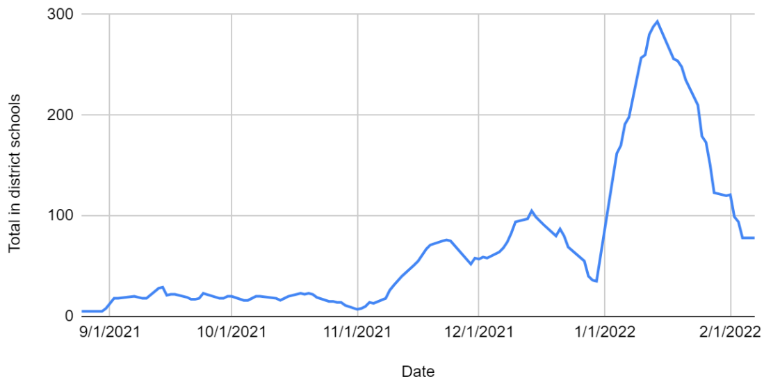
Total cases associated with district schools over the past 14 days