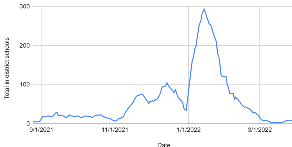
Total cases associated with district schools over the past 14 days