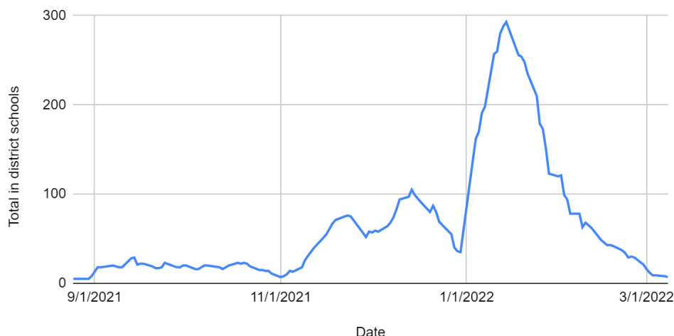
Total cases associated with district schools over the past 14 days