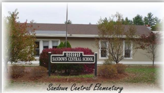
Sandown Central Elementary