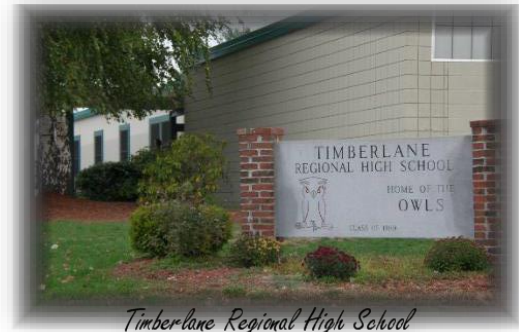
Timberlane Regional High School