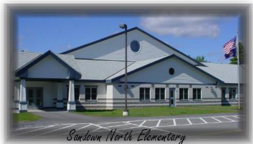
Sandown North Elementary