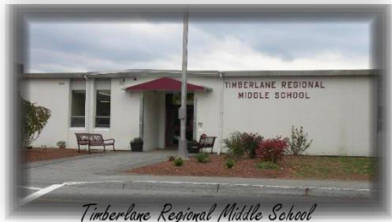
Timberlane Regional Middle School