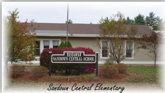
Sandown Central Elementary