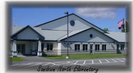
Sandown North Elementary