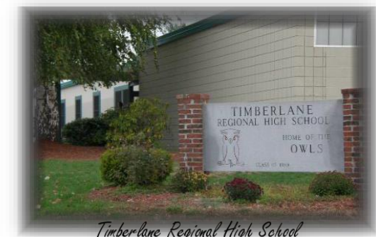
Timberlane Regional High School