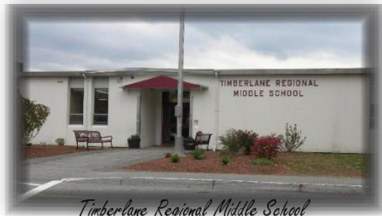
Timberlane Regional Middle School