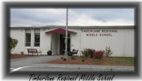
Timberlane Regional Middle School