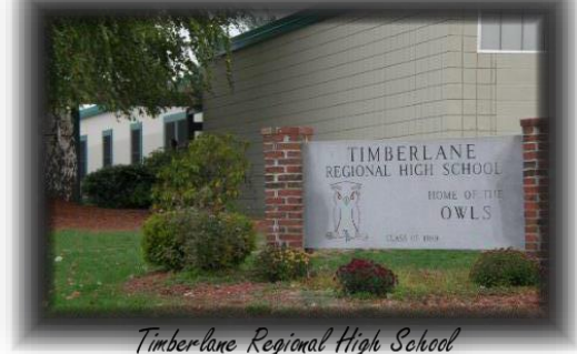
Timberlane Regional High School