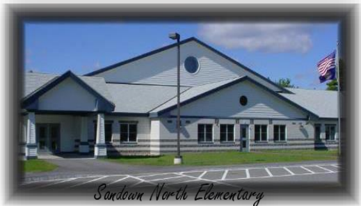
Sandown North Elementary