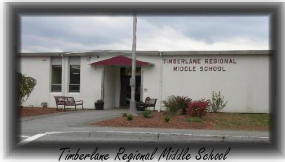
Timberlane Regional Middle School