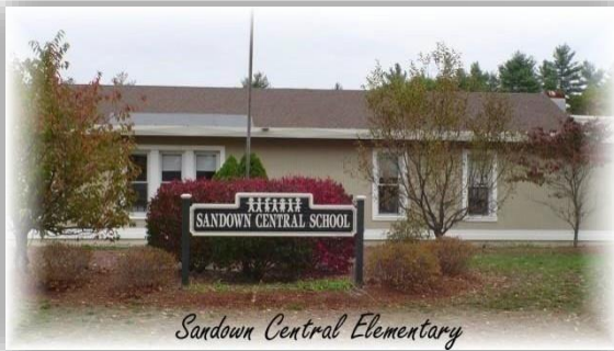
Sandown Central Elementary