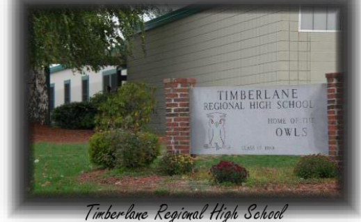
Timberlane Regional High School