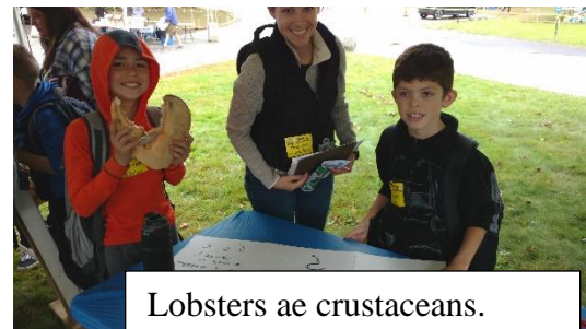
Lobsters are crustaceans.

All that attended had a day that won't soon be forgotten. The learning